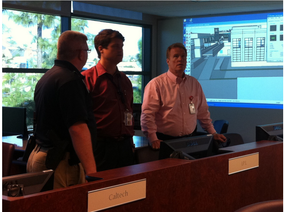
Caltech staff members tour PCC’s new Emergency Operations Center facility.

“Our partnership with the city of Pasadena, Caltech and JPL is the beginning of a relationship that all community colleges should mirror.